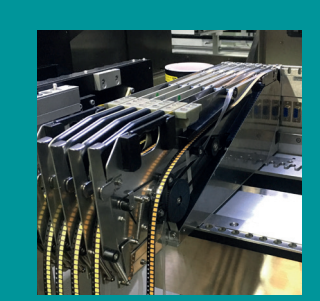
Intelligent feeders in all common sizes Component spectrum from 0402 to 18x20 mm