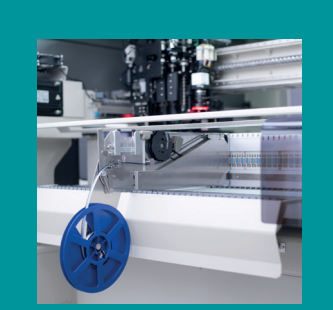
Intelligent feeders in all common sizes. Component spectrum from 01005 to 100x150 mm, component height up to 15mm